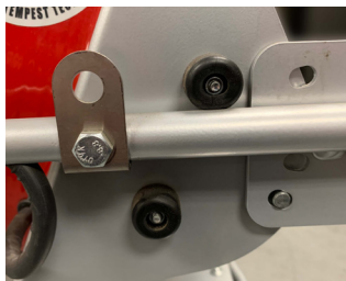
Precise, Locking Tilt-Angles