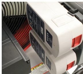
Immediately Shore Power Ready

Our battery-driven series delivers a level of utility and performance found with no other battery-driven fan. But when you want to connect to power, Shore Power is standard on every Tempest Battery-Powered Fan that we build.