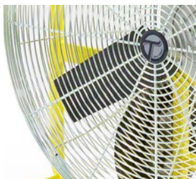
Open Grille Guard