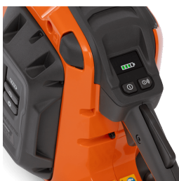
High Power Pace Battery System