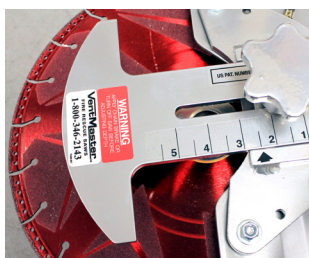
Tool-Less "KIS-360" Aluminum Depth Gauge