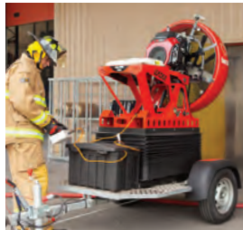
Trailer-Mounted for easy transport