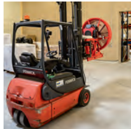
Skid-Mounted for easy mobility