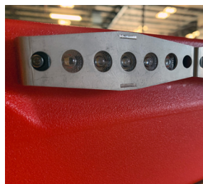
Active LED Lighting