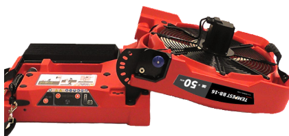
+65° at -90° Tilt Range