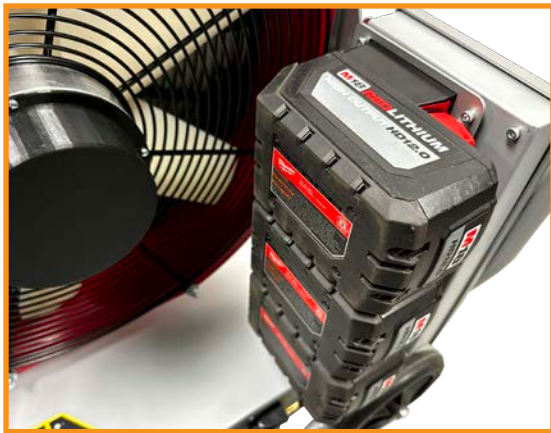
Powered by 1 and up to 3 Milwaukee® M18™ REDLITHIUM™ HIGH OUTPUT™ HD12.0 Batteries

TEMPEST TECH SERIES BATTERY POWER BLOWERS