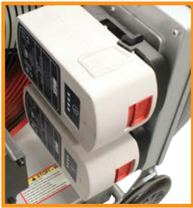
Powered by 2 HURST® Jaws of Life® E3™/EWXT™ 9Ah or 5Ah Rescue Batteries.