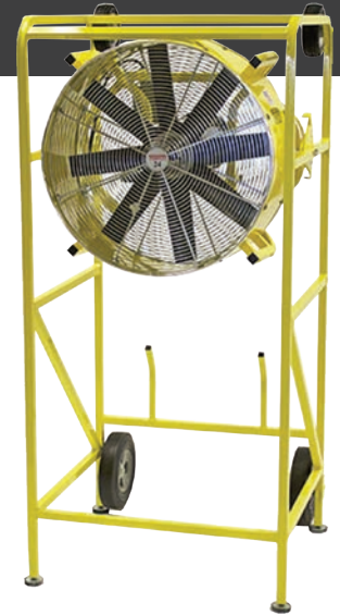
24-HD-T-EP Part #913-1180 12,867 CFM 24-HD-T-EP-H Part #913-1181 12,867 CFM