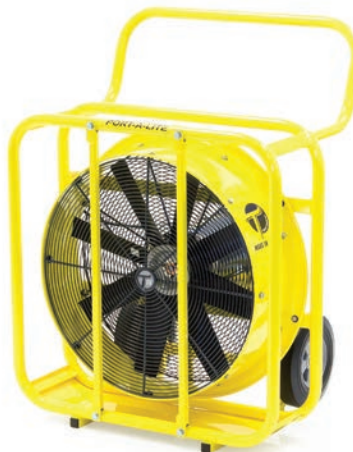
PAL-24 Part #913-1065 12,867 CFM PAL-24-EP Part #913-1070 12,867 CFM PAL-24-VSR Part #913-1060 15,663 CFM