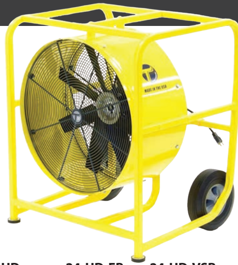
24-HD Part #913-1160 12,867 CFM 24-HD-EP Part #913-1161 12,867 CFM 24-HD-VSR Part #913-1163 15,663 CFM