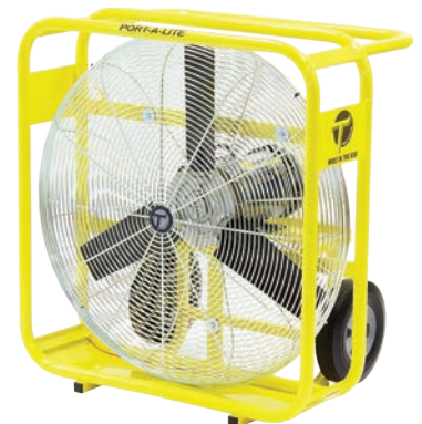
PAL-30 Part #913-1080 13,000 CFM PAL-30-VSR Part #913-1085 15,072 CFM

Explosion Proof Options, Dust Collection & Ventilation Accessories help keep our customers within OSHA guidelines and keep them on schedule.