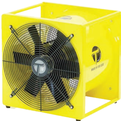
EBS-16 Part #913-1000 3,200 CFM EBS-16-EP Part #913-1001 3,200 CFM EBS-16-S-HP Part #913-1010 11,804 CFM