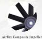
Airflex Composite Impeller