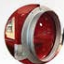
Clip on Duct Hose Adapter