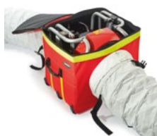
V-Box in extraction mode