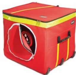
Ductless V-Box cube