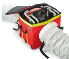
V-Box in blowing mode