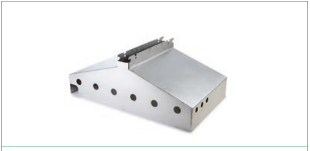
Adaptor for PYROS 3

H: 27.5 cm / L: 71 cm / D: 61.5 cm / Weight: 8 kg