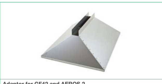
Adaptor for GF42 and AEROS 2

Necessary for installing the training modules - Warranty: 1 year