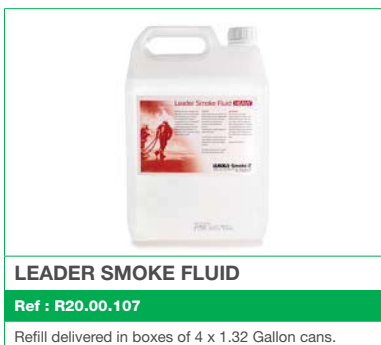
LEADER SMOKE FLUID