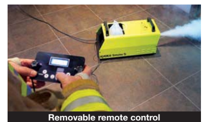
Removable remote control