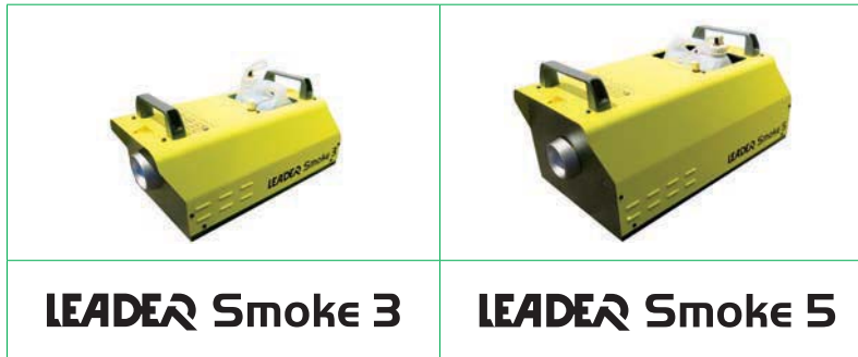
LEADER Smoke 3