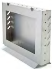
V90-80-071 Prop - Flat Screen Module Dimensions: 15 x 18.5 x 3.5 Weight: 14 lbs