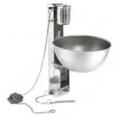
V90-80-073 Prop - Oil Explosion Dimensions: 18 x 10.5 x 12 Weight: 6 lbs