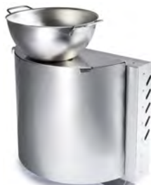
V90-80-070 Prop - Chip Pan Fire Module Dimensions: 5.5 x 15.5 x 10.5 Weight: 3 lbs