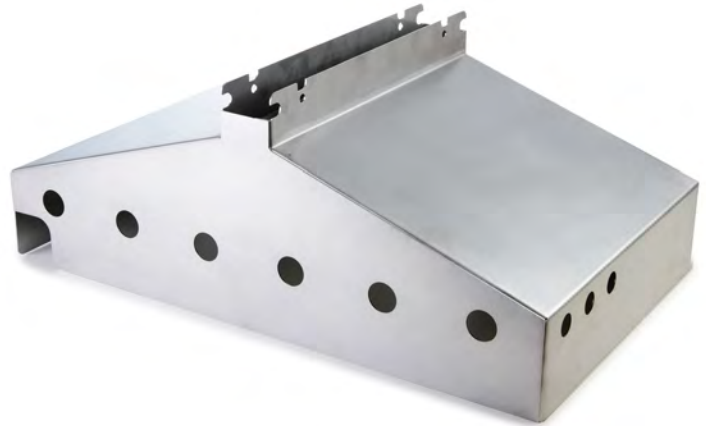
Connector Module for PYROS 3 V90-80-077 Prop Adapter for Motor, Bin, and Screen Dimensions: 11.5 x 29 x 18 Weight: 20 lbs