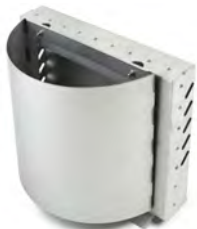
V90-80-062 Prop - Trash Bin Module Dimensions: 14 x 15.5 x 7 Weight: 6 lbs