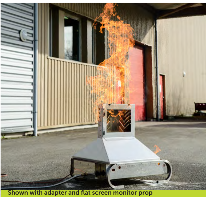
Shown with adapter and flat screen monitor prop