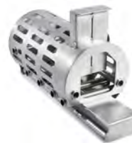
V90-80-075 Prop - Aerosol explosion Dimensions: 9 x 10.5 x 8 Weight: 34 lbs