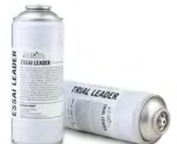
V90-80-079 Prop - Aerosol Cans Case of 12 Dimensions: 24 x 24 x 8 Weight: 6 lbs