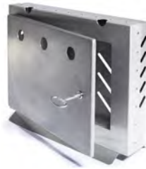
V90-80-075 Prop - Electrical Cabinet Door + Key Dimensions: 15 x 18.5 x 4.5 Weight: 14 lbs