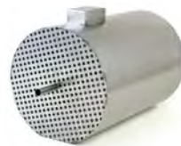
V90-80-063 Prop - Electric motor Dimensions: 14 x 13 x 22 Weight: 15 lbs