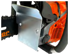
Steel Deflector Plate