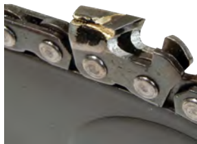
Raptor Carbide Chain

Tested in the world's most rugged environments, the 572HD® is ready for demanding work by Fire Fighters. At just 14.5lbs, the 572HD® has a better power-to-weight ratio and 12% higher culling capacity. Excellent cooling and heavy-duty filtration maximize reliability, while a smart design accommodates longer guide bars.