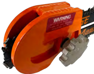
Tool-Less "KIS-40" Aluminum Depth Gauge