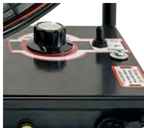
Immediately Shore Power Ready