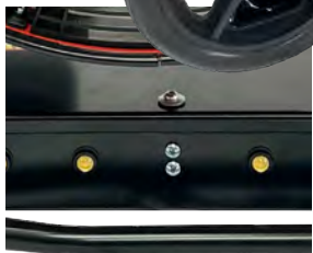
Active LED Lighting