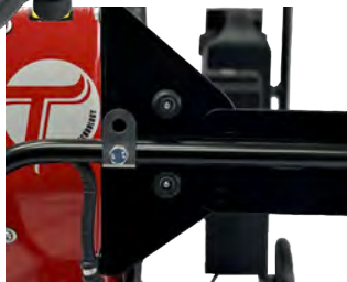
Precise, Locking Tilt-Angles