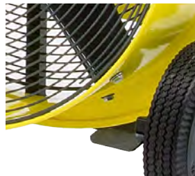
"Winning Step" Tilt

Our Variable Speed VS Drive and massive 2.0 HP motor, paired with our signature blade and shroud designs deliver the absolute best in GFCI compatible performance.