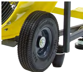
Large 8" Non-Pneumatic Wheels