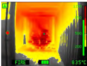
FIRE (Standard) -40°F to +2,100°F