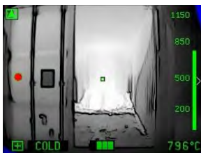
COLD (Optional) Blue for coldest areas