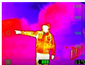
MULTICOLOR (Optional) For Industrial Applications