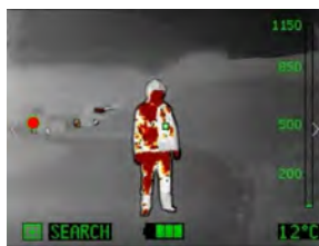
SEARCH A Simple Binary Mode for Quick Search