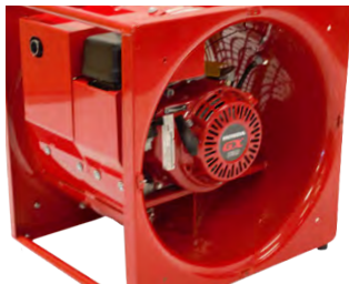
Best In Class Gasoline Engine