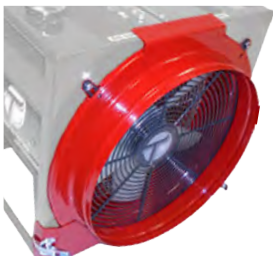
Clip-On Hose Adapter

Popular unit for all forms of confined space ventilation, a design that's been used for decades. It's light and small enough to ventilate tight areas yet still built to Tempest's high standard of long lasting durability and reliability. Remove the smoke/fumes/particulates out from almost any location, or turn it around and blow them out.