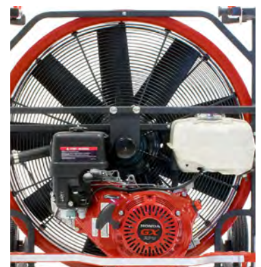
Best In Class Gasoline Engine