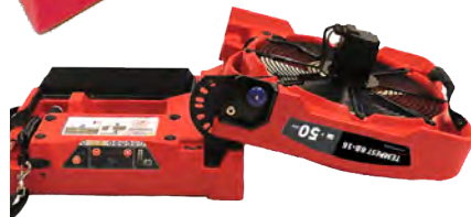
+65° at -90° Tilt Range

Our battery-driven series delivers a level of utility and performance found with no other battery-driven fan. But when you want to connect to power, Shore Power is standard on every Tempest Battery-Powered Fan that we build.