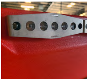
Active LED Lighting